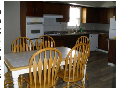
An expansive kitchen provides space to prepare food for residents and guests at the Niles recovery community.

In March 2018, renovation work on a home within Glenbeigh's sober living community was completed. The home accommodates up to 5 residents, has a spacious kitchen, living area, bedrooms as well as front and back porches.