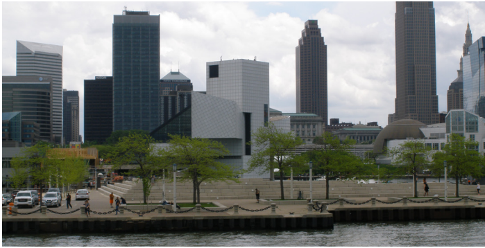
A view of the Cleveland skyline from onboard the Goodtime III. The cruise featured great food, music and comedy.